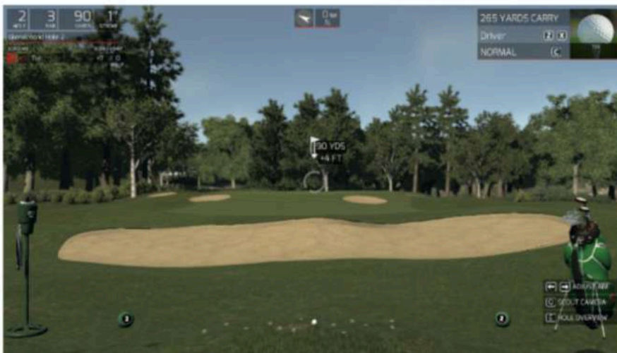
Glenalmond hole 2 simulation