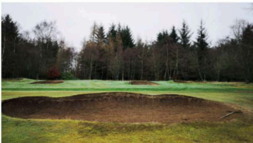
Glenalmond hole 2